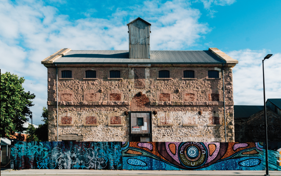
CLOCKWISE FROM LEFT: Golden hour at the al fresco dining area of La Popular Taqueria; Street art adds to Port Adelaide's layered history; La Popular presses its tortillas in-house; Port Adelaide's iconic lighthouse.